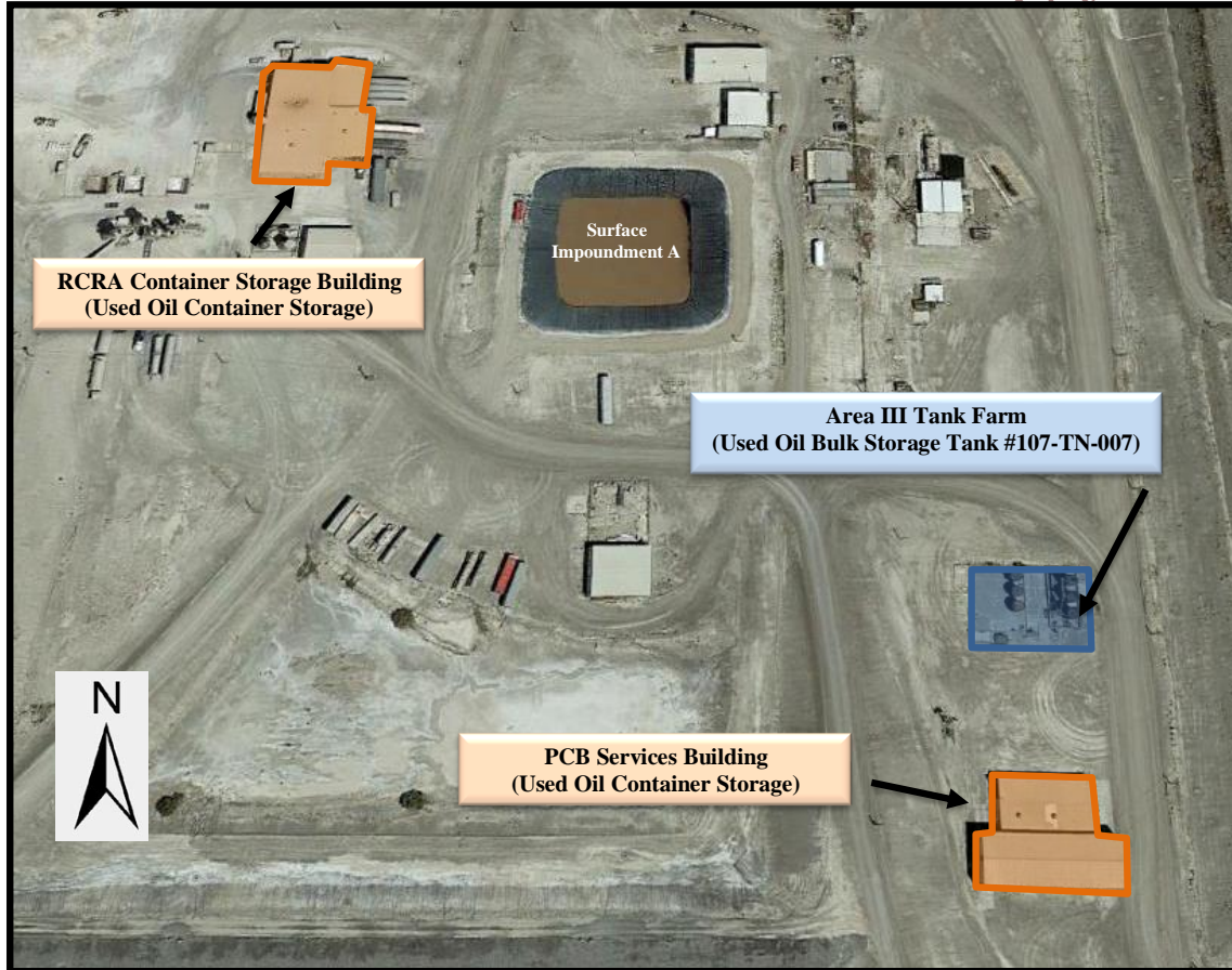
Figure 2: Container and Bulk Used Oil Storage Area Locations